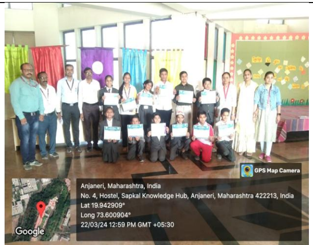
Teachers and participant students at Orchid International School