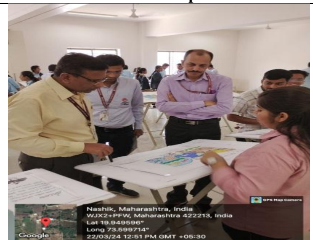
Students describing posters to judges