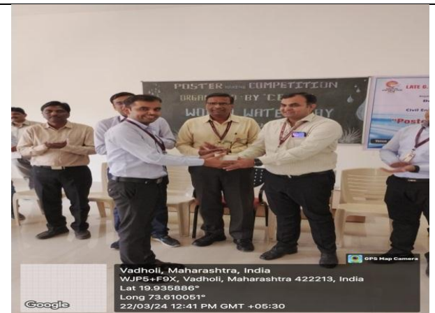
Felicitation of E&Tc Department HOD