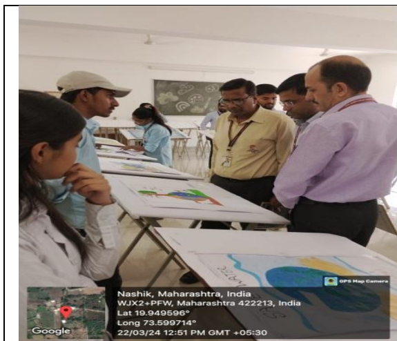
Judges & HoD while visiting the posters