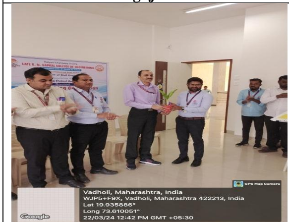
Felicitation of judges