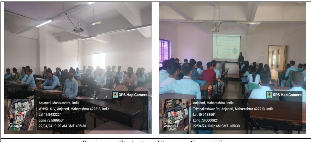
Participant Students in Elocution Competition