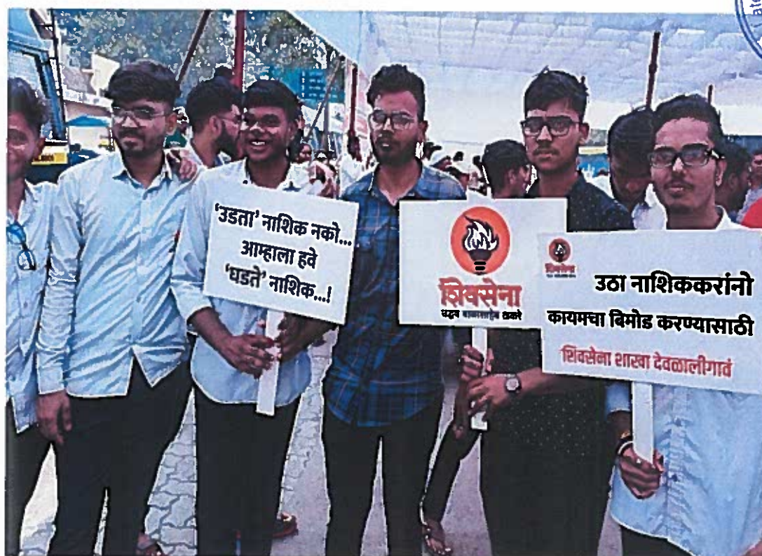
NSS Volunteers at rally with awareness posters