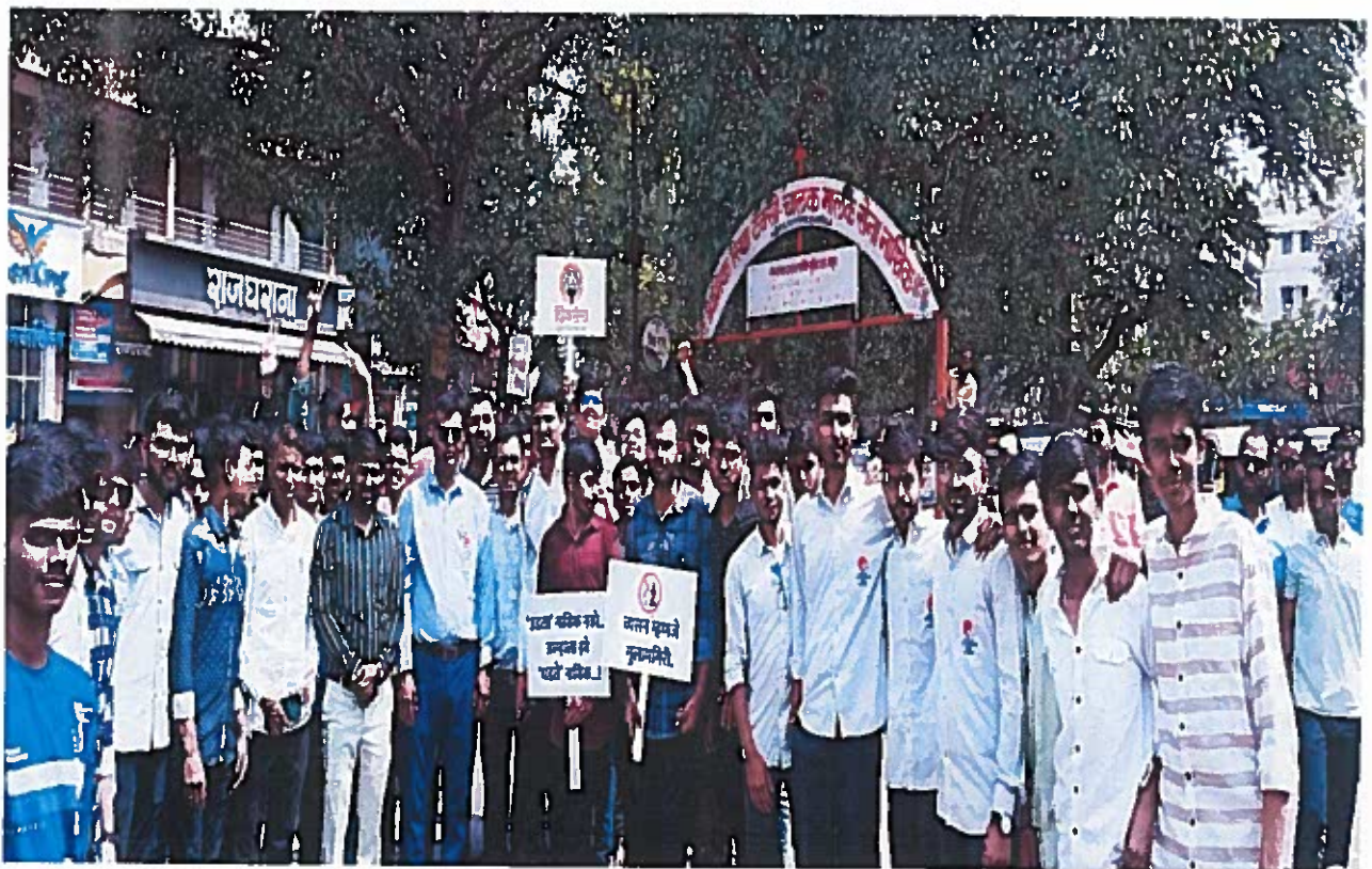
Students, Volunteers gathered at location for the activity