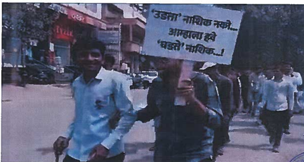
NSS Volunteers participated in rally with banners and slogans