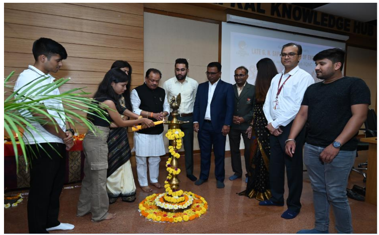
Lightening the Lamp